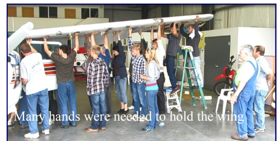
Many hands were needed to hold the wing

Bakke ferried it to our hangar in June. Over the next two months, many items ordered by PMA arrived at the MATA hangar to also go in the shipment, including three aircraft engines, propellers, 40 cases of aviation oil, and a hydraulic dolly.