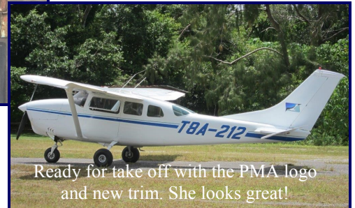
Ready for take off with the PMA logo and new trim. She looks great!