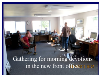
Gathering for morning devotions in the new front office